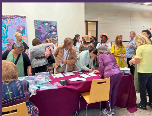
Artists from around the world line up for their free eye screenings