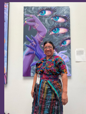
An artist from Guatemala poses for a picture after receiving an eye screening and a new pair of prescription glasses